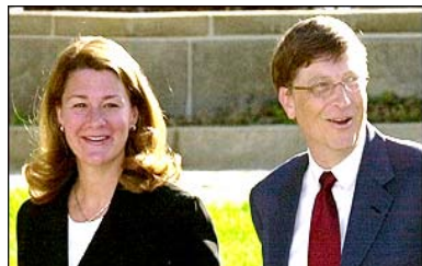
Melinda and Bill Gates

Public libraries in South Carolina are receiving a third round of funding from the Bill and Melinda Gates Foundation. The Fairfield County Library has received $14,793.00 for the Main Library and the Ridgeway Branch. The funds are designated for upgrading public access computers.