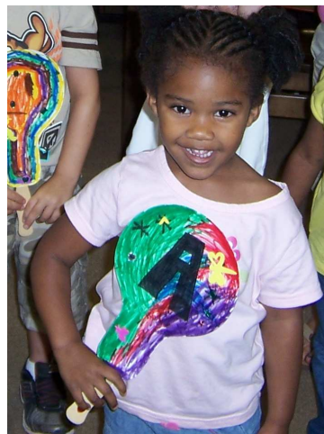
A big smile and a hot air balloon!