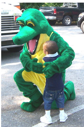
The EMS alligator is always a hit at the kick-off party!