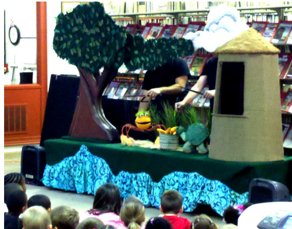
Columbia Marionette Theater mesmerizes the audience with "Anansi the Spider"