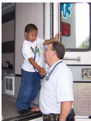
Checking out the EMS guy!