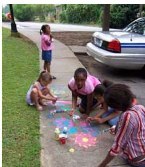
Decorating the sidewalk.