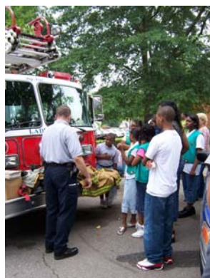
Public Safety demonstration.