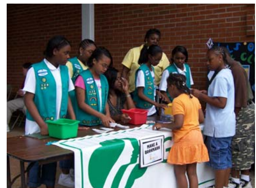
The Girl Scouts helped at the Sign-Up Party and recruited participants for their Book Club. The book they are reading is The Lion, the Witch, and the Wardrobe by C. S. Lewis.