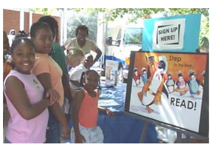
Scenes from Summer Reading Kick-Off