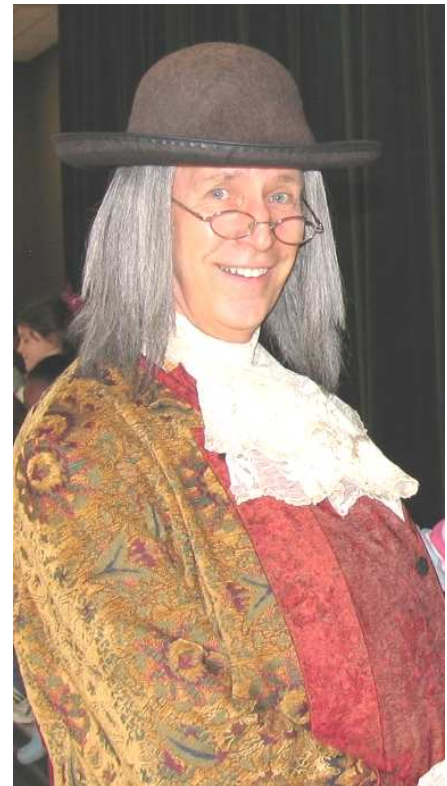
Meet Ben Franklin at the library on January 13th at 6:00 p.m.

How could a person with only two years of schooling become one of the best educated, wisest and most productive people of his time? Reading was the key. Come learn the secrets of one of the world's best and most famous readers as Ben discusses his life and achievements. Learn three reasons reading is magic, four reading virtues, and how young Ben Franklin participated in one of the most memorable moments in American literature. Fun for all ages!