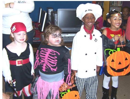
Halloween Costume Contest Participants