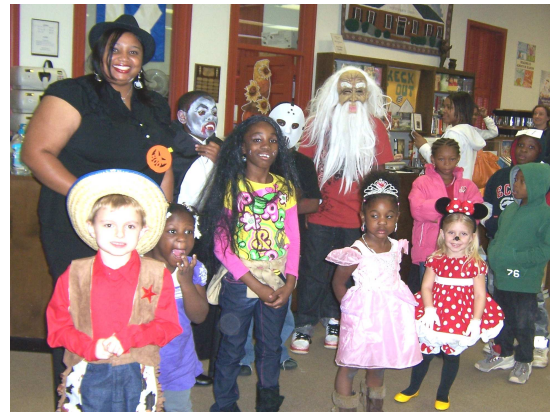
Halloween Costume Contest Participants