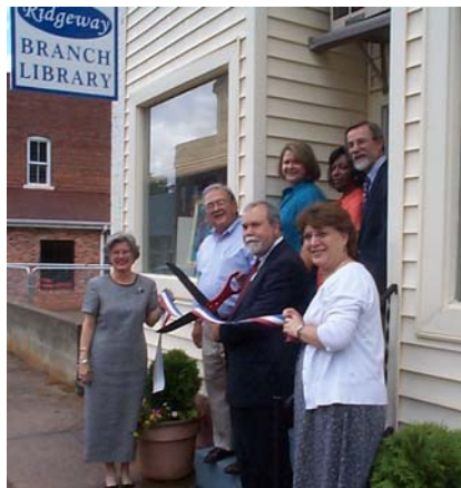
Ridgeway Branch Library reopened in June.