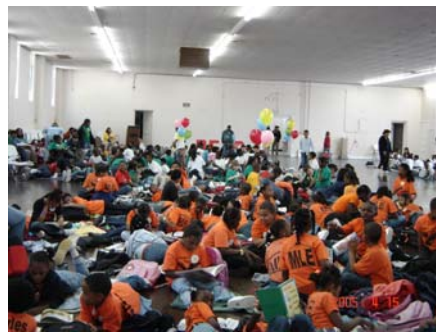
In April, around 400 students enjoyed the annual Read-In at the Old Armory.

The Friends enjoyed author programs and had a great book sale in 2005