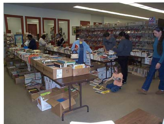
Searching for bargains at last year's sale.

Monday, May 3rd-Friday, May 14th Sale open during regular library hours